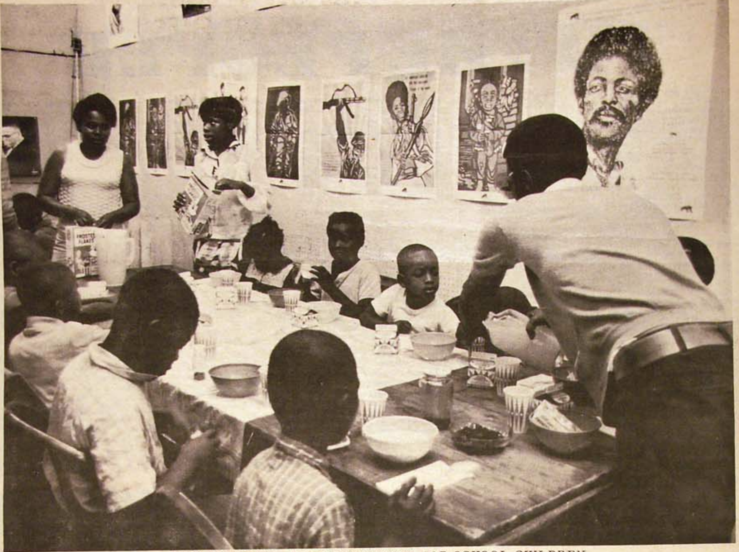
PHILADELPHIA FREE BREAKFAST FOR SCHOOL CHILDREN