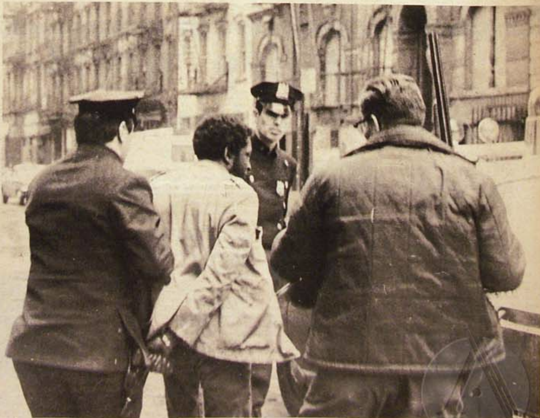
THE N. Y. 21, MITCHELL'S HANDYWORK

It is clear from the prominent position of Mitchell & Co. in governmental strategy that the ruling class hopes to rely heavily on the police and courts to solve their growing problems. As Mitchell put it, the Justice Department "is an institution for law enforcement, not social improvement." But no police terror ever solved the problems of racism, war and poverty in capitalist society, and no court flunkies ever stopped a revolution!