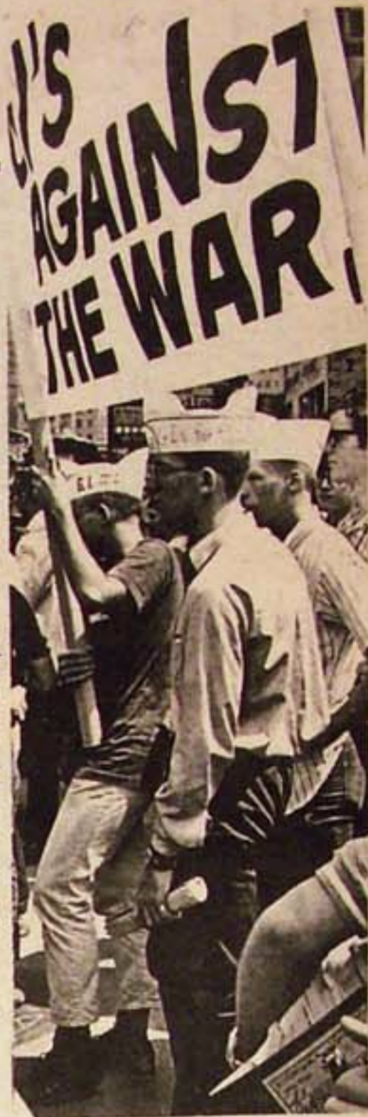
GIs lead New York demonstration.